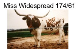
Miss Widespread 174/61