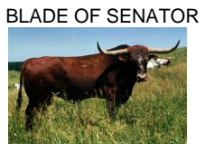
BLADE OF SENATOR