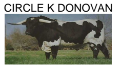
CIRCLE K DONOVAN