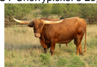
EOT Cherrypicker's Legend